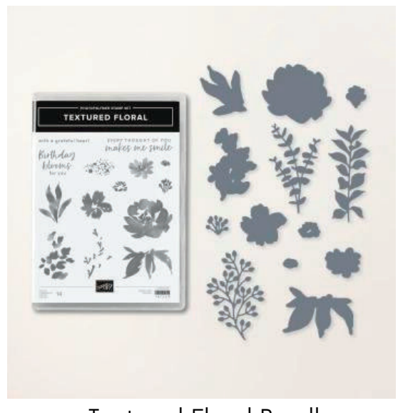
Textured Floral Bundle #161232