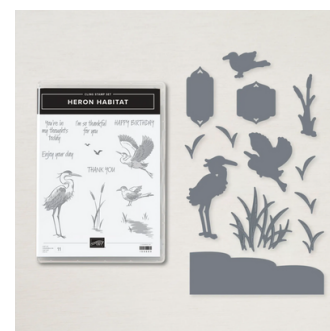
Heron Habitat Bundle #158897