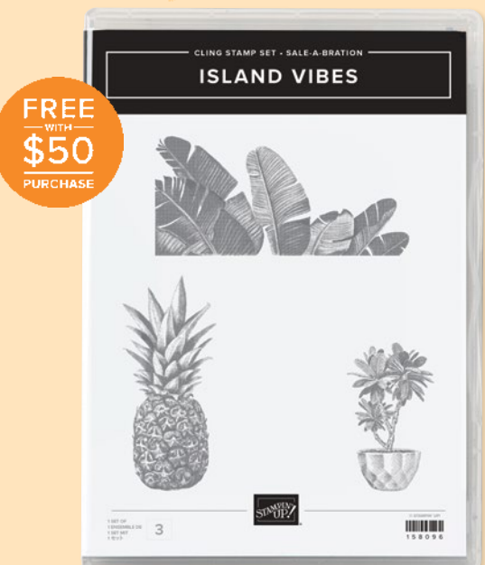
INK. ISLAND VIBES • 158096 FREE!

3 cling stamps (suggested clear blocks: d, e)